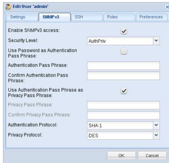
Figure 3: SNMP v3 user setup dialog of web user interface